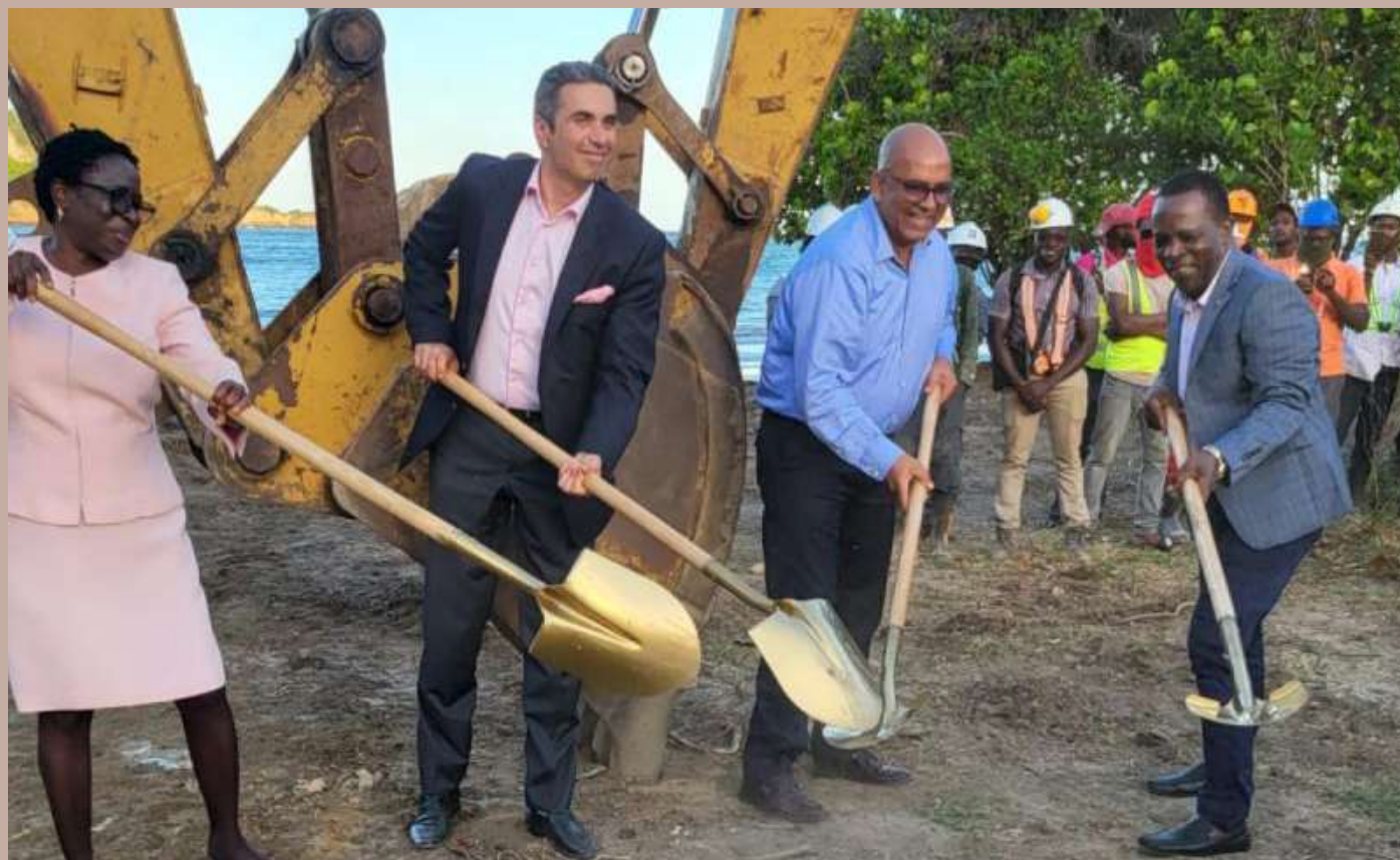
Top: Park Hyatt St Kitts, St Kitts & Nevis | Developed by Range Developments

InterContinental Hotels & Resorts has become synonymous with bold exploration, travel and cultural discovery, having pioneered luxury travel in emerging and well-loved destinations for the past 75 years.