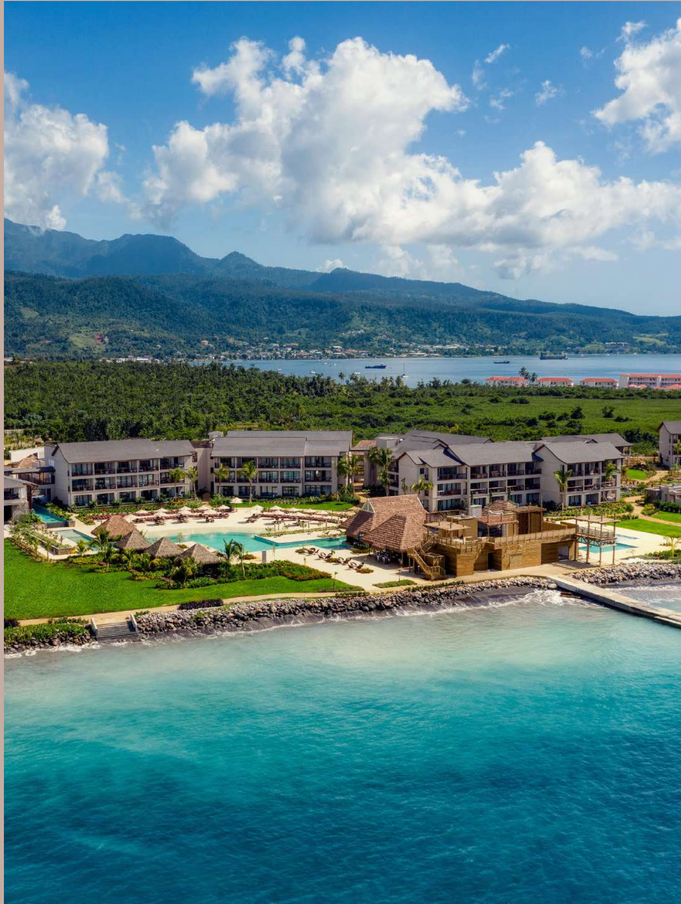
Cabrits Resort &amp; Spa Kempinski, Dominica | Developed by Ranged Developments