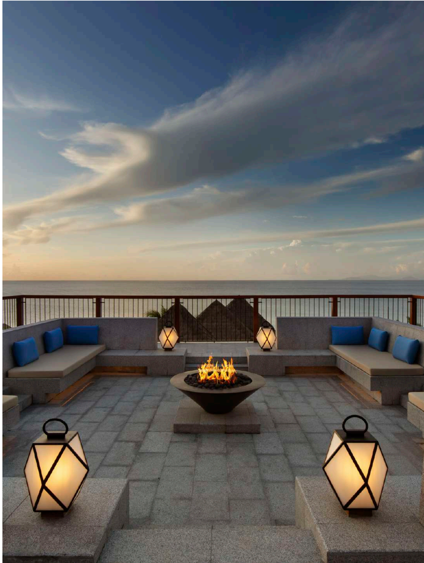
Cabrits Resort &amp; Spa Kempinski, Dominica | Developed by Ranged Developments