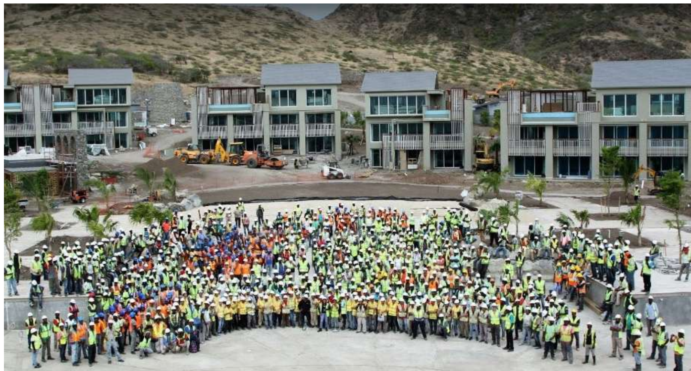
Top: Park Hyatt, St Kitts, St Kitts & Nevis | Developed by Range Developments Bottom: Range Developments | Construction Team